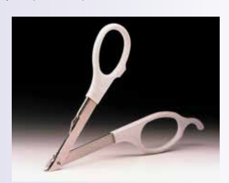
SR-3 (scissors-style staple remover)