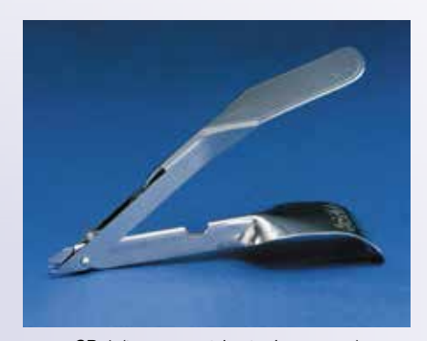
SR-1 (tweezers-style staple remover)

Simple to Remove—Squeeze, lift and remove.